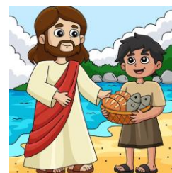
Just shows what we can do with a little if we share

Jewish Prayer of Thanks Blessed are You, Lord our God, King of the universe, who has brought forth bread from the earth.